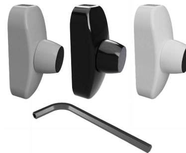
OPTIONAL CUSTODIAL LOCK WITH REMOVABLE MAINTENANCE WRENCH

Charts are based upon an insulating glass unit infill of 1" [25.4mm] overall thickness comprised of 6mm glass/13mm gas fill/6mm glass