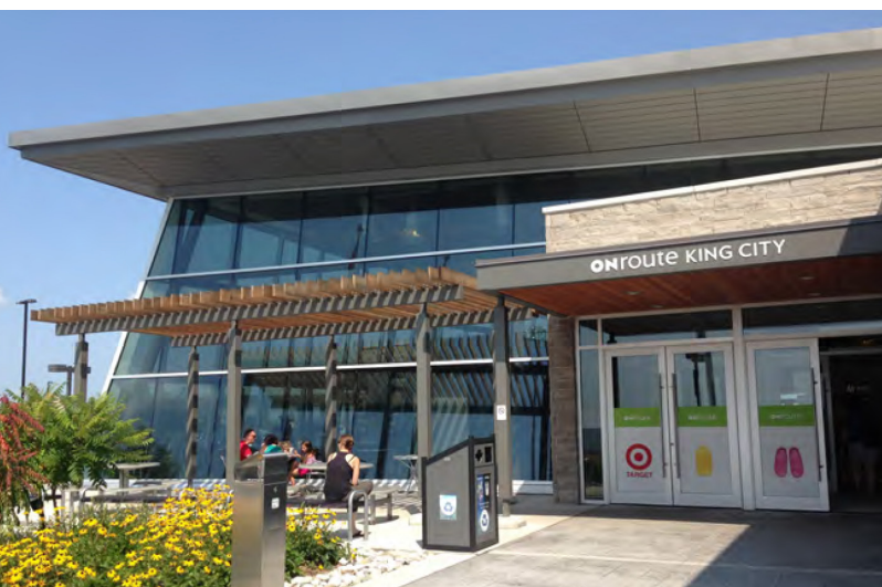
Onroute King City, ON