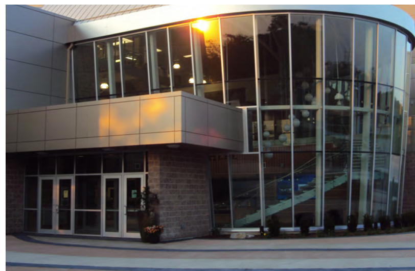
St-Clair College Sportplex Windsor, ON