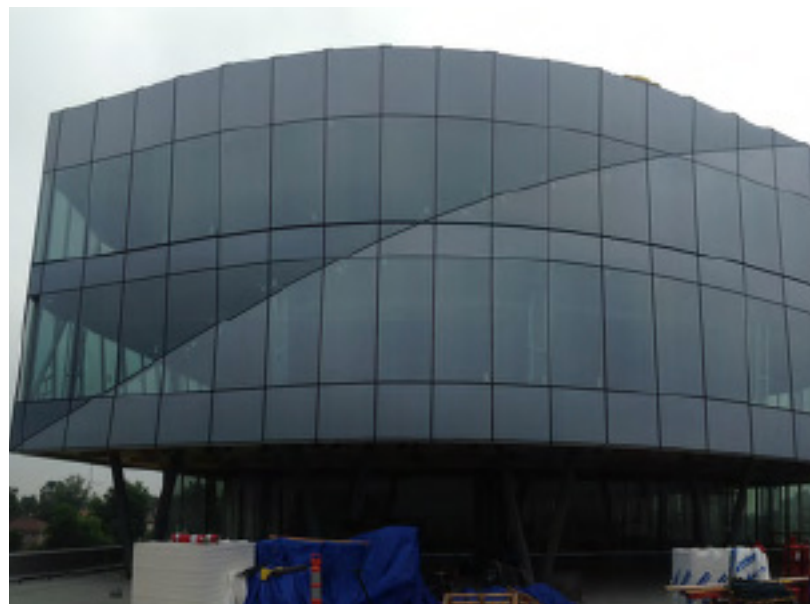
Google Kitchener-Waterloo Canadian Development Headquarters- Kitchener, ON