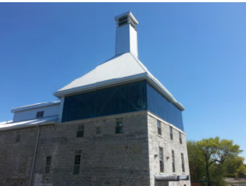
The Tett Centre Kingston, ON